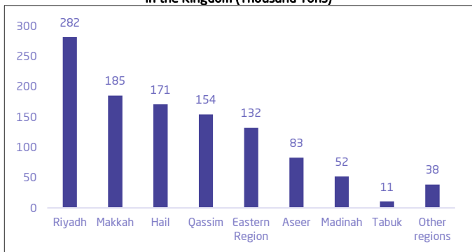
Figure 2. Quantity of produced broiler chicken at the level of administrative regions in the Kingdom (Thousand Tons)

The results of the comprehensive agricultural survey for 2023 showed that the total amount of broiler chicken produced across the Kingdom reached 1,107 thousand tons (Figure 2). Riyadh ranked first in terms of broiler chicken production, reaching 282 thousand tons, followed by Makkah in second place with a production of 185 thousand tons, and hail in third place with a production of 171 thousand tons.