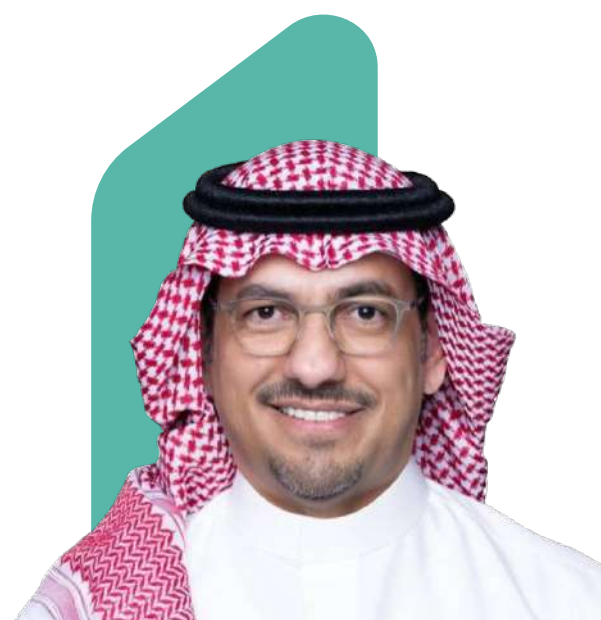
Prince Waleed bin Nasser Al Saud