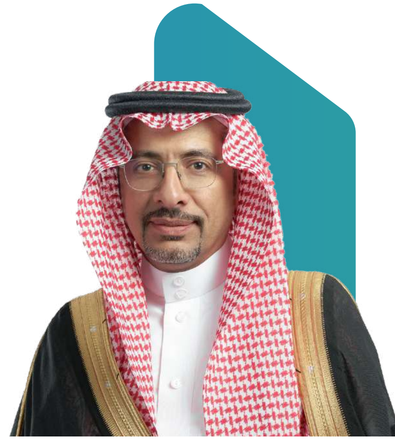
H.E Minister of Industry and Mineral Resources Bandar bin Ibrahim Alkhurayef