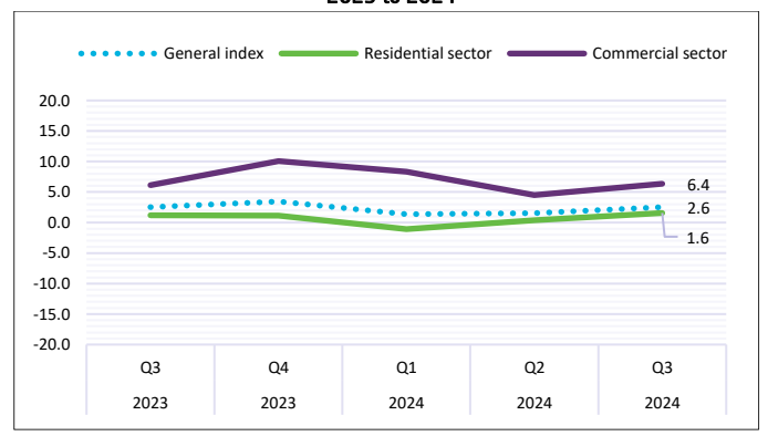
Graph 2. Changes in Real Estate Prices (%) for Major Residential Types in Q3 from 2023 to 2024